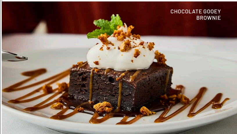
CHOCOLATE GOOEY BROWNIE

for your Guests to take home 300 cal (+7)