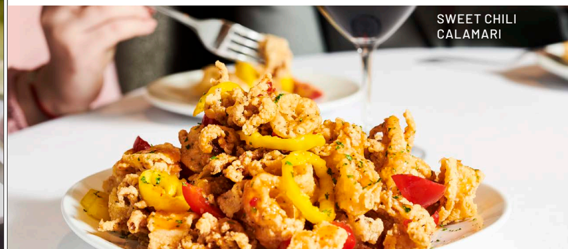
SWEET CHILI CALAMARI