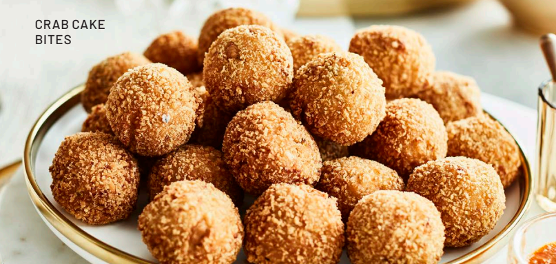
CRAB CAKE BITES