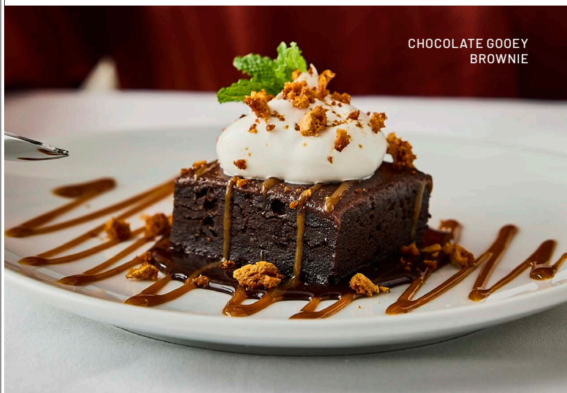
CHOCOLATE GOOEY BROWNIE

cavatappi, smoked cheddar, chipotle panko breadcrumbs 1260 cal