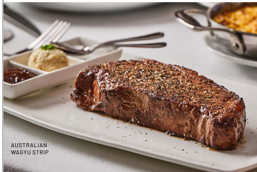
AUSTRALIAN WAGYU STRIP

Includes coffee, tea, and soft drinks (0-190 cal).