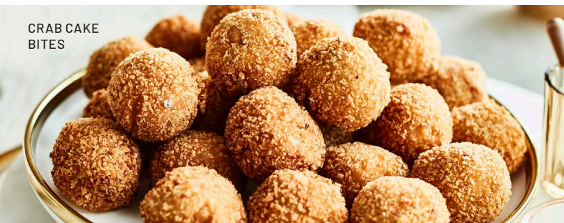
CRAB CAKE BITES