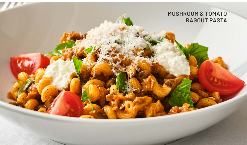
MUSHROOM & TOMATO RAGOUT PASTA

burrata, campari tomato, torn basil 1060 cal