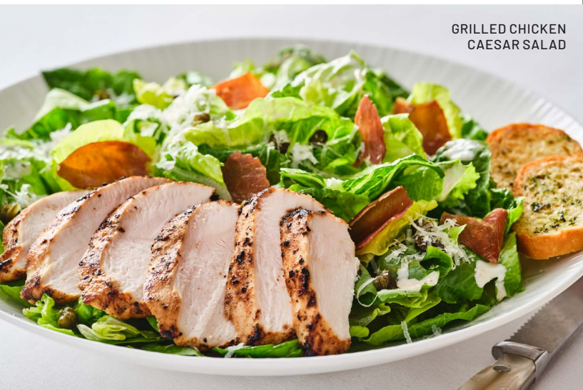
GRILLED CHICKEN CAESAR SALAD

burrata, campari tomato, torn basil 1060 cal