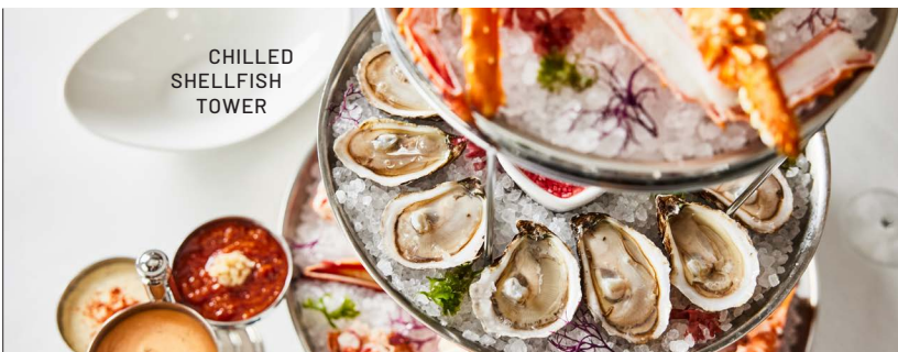
CHILLED SHELLFISH TOWER