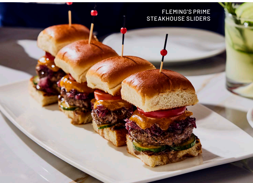
FLEMING'S PRIME STEAKHOUSE SLIDERS

featuring carrot cake, chocolate dipped strawberries, orange chocolate truffles 1970 cal | 30