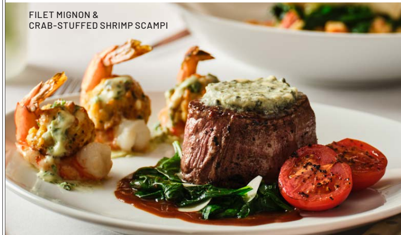
FILET MIGNON & CRAB-STUFFED SHRIMP SCAMPI