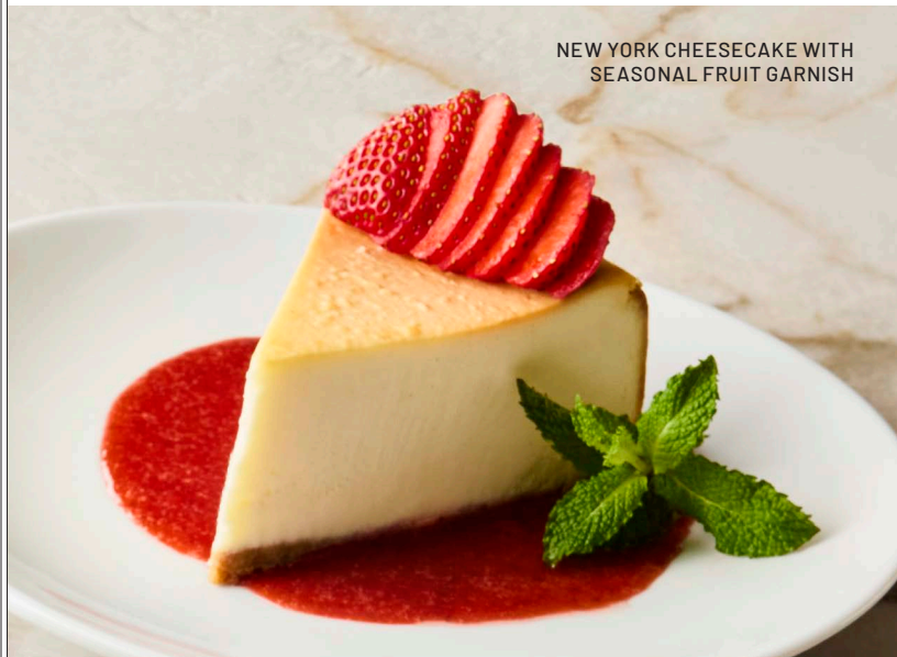
NEW YORK CHEESECAKE WITH SEASONAL FRUIT GARNISH

gochugaru flakes, red onion, thai sesame oil 430 cal