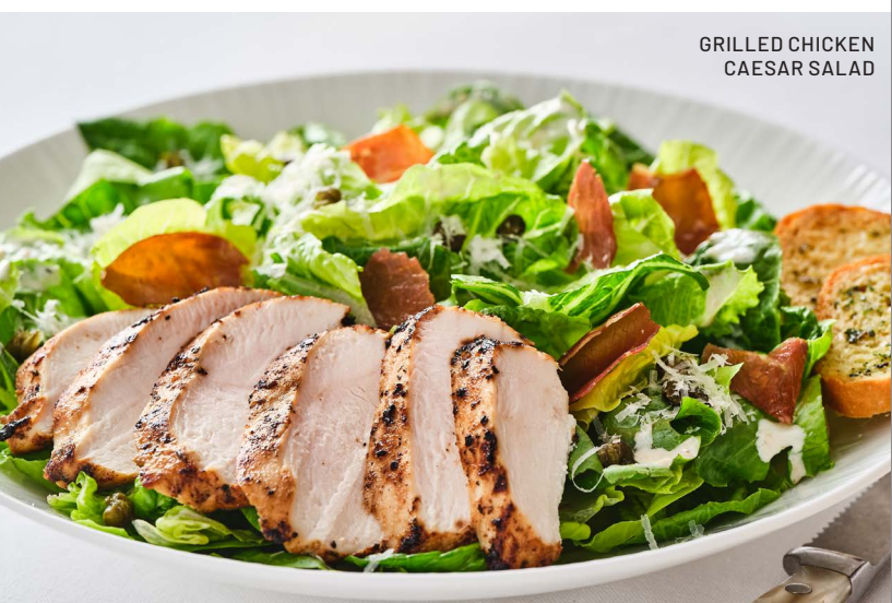
GRILLED CHICKEN CAESAR SALAD

for your Guests to take home 300 cal (+7)