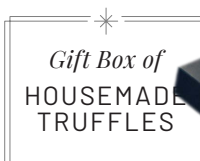
Gift Box of HOUSEMADE TRUFFLES

featuring carrot cake, chocolate dipped strawberries, orange chocolate truffles 1970 cal