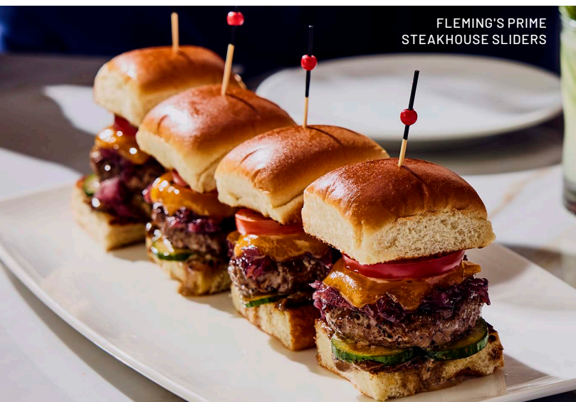
FLEMING'S PRIME STEAKHOUSE SLIDERS

for your Guests to take home 300 cal (+7)