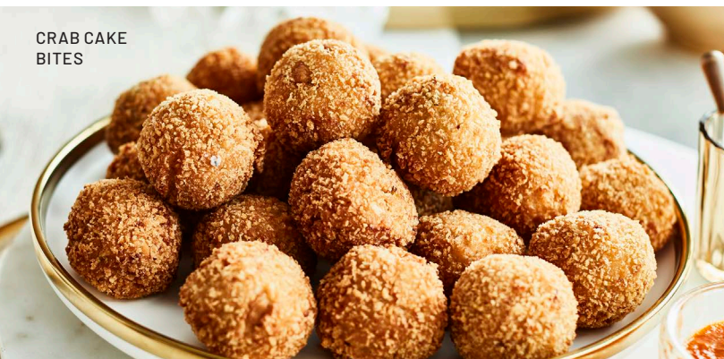
CRAB CAKE BITES