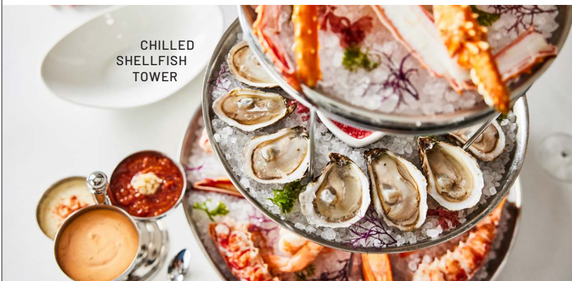
CHILLED SHELLFISH TOWER