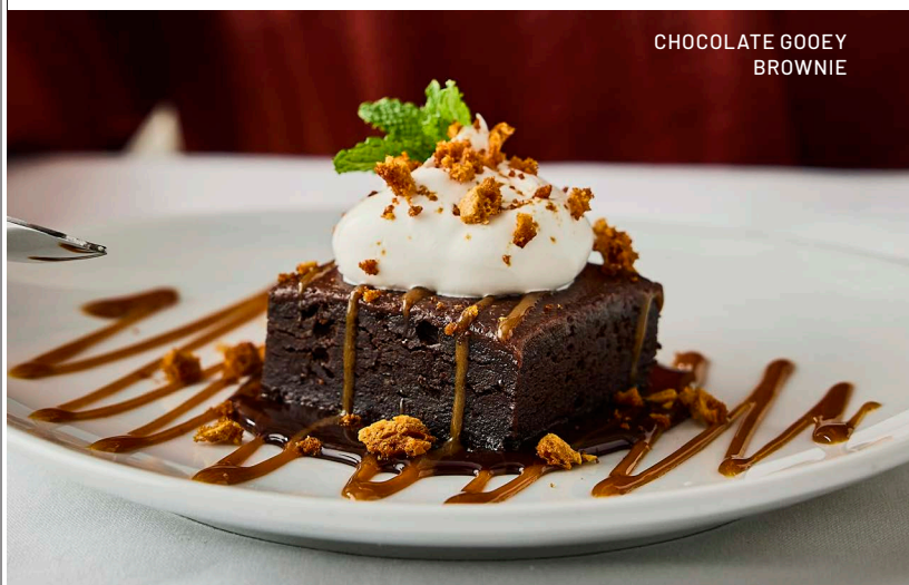
CHOCOLATE GOOEY BROWNIE