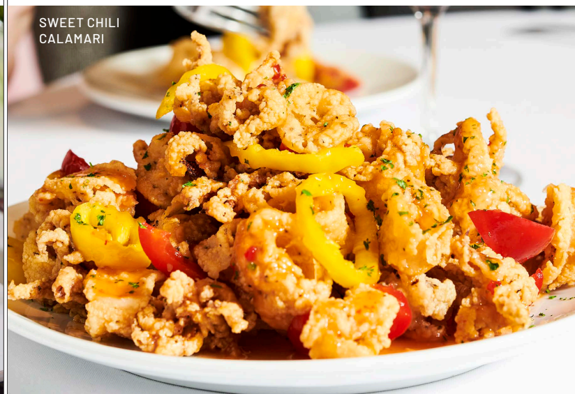
SWEET CHILI CALAMARI

†Price does not include sales tax, gratuity or applicable private dining fees.